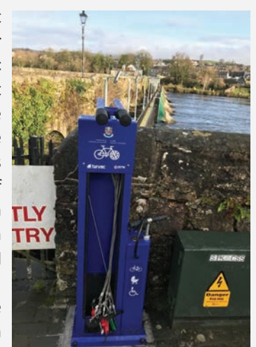
Bicycle Repair Station at Killaloe.

The provision of bicycle repair stations in the town has also occurred in the recent past. This initiative is