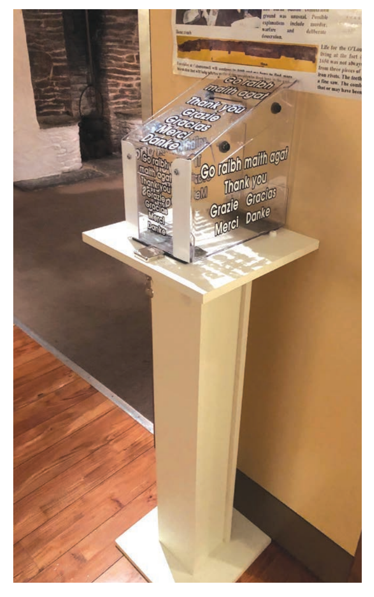
Museum donations box.

The new donations box has been installed in keeping with internal audit requirements.