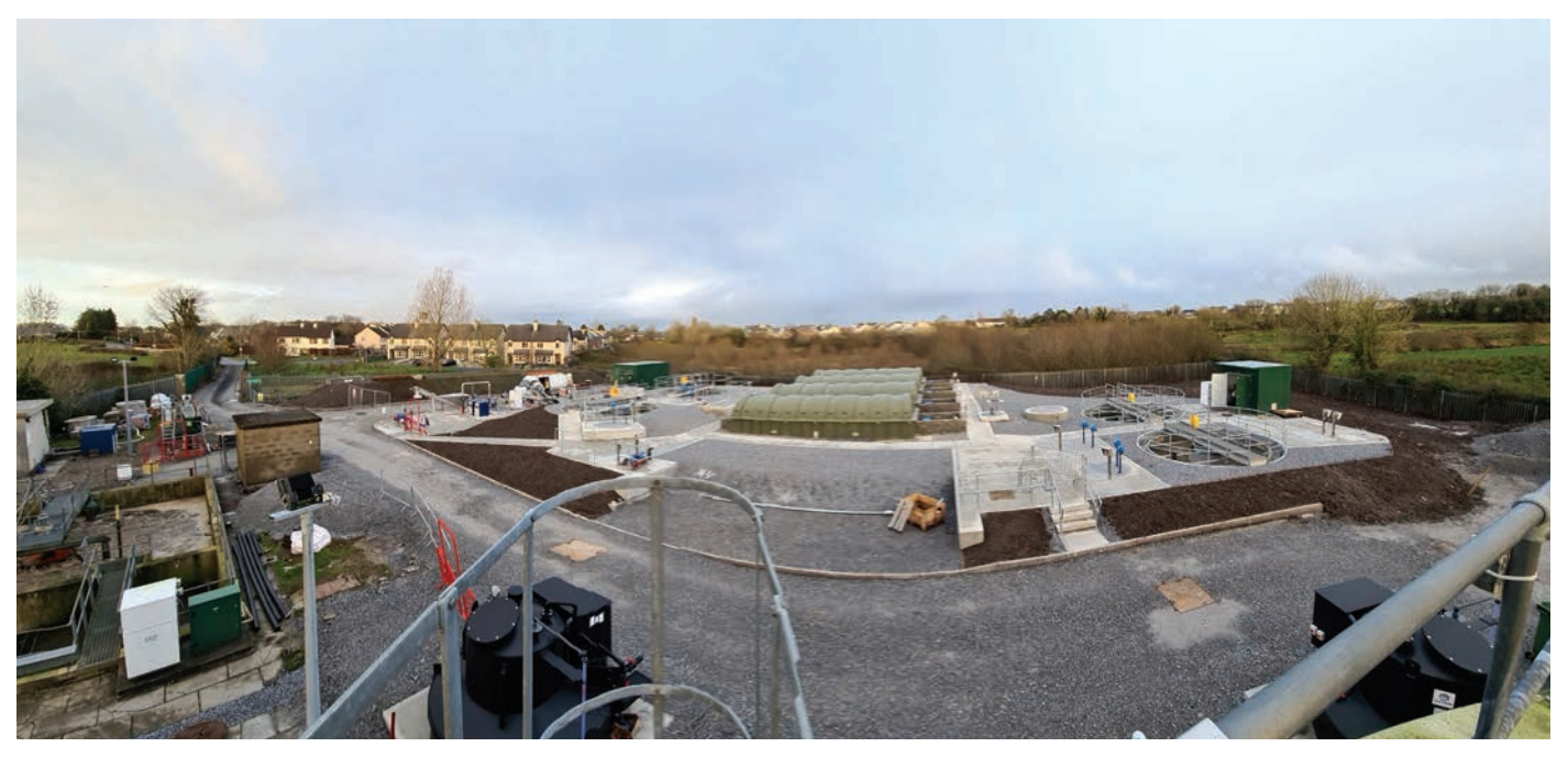
The new upgraded Quin Waste Water Treatment Plant which is nearing completion.