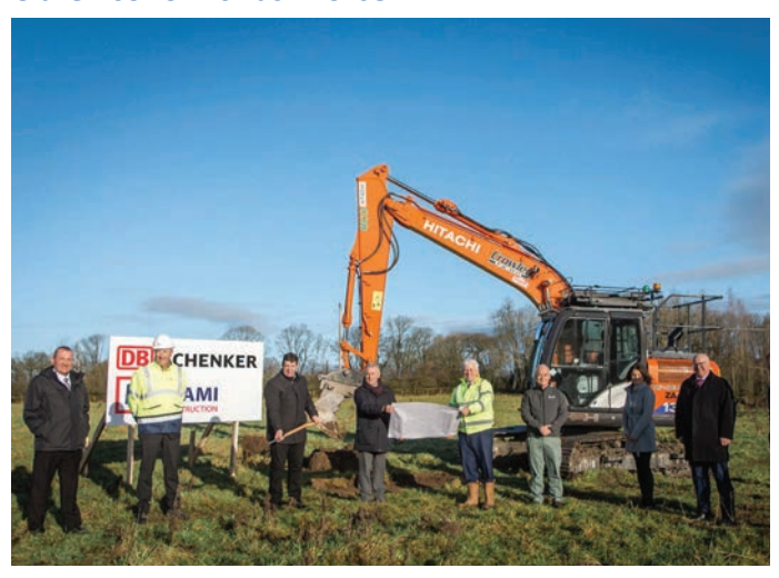
The Chief Executive and Director of Economic Development attended the sod-turning ceremony for the new DB Schenker building at Smithstown East, Shannon.

As a local authority we are regularly challenged to provide relevant up-to-date data reflecting current trends. This is become increasingly important as the recent Covid-19 pandemic is driving radical change in the manner in which the