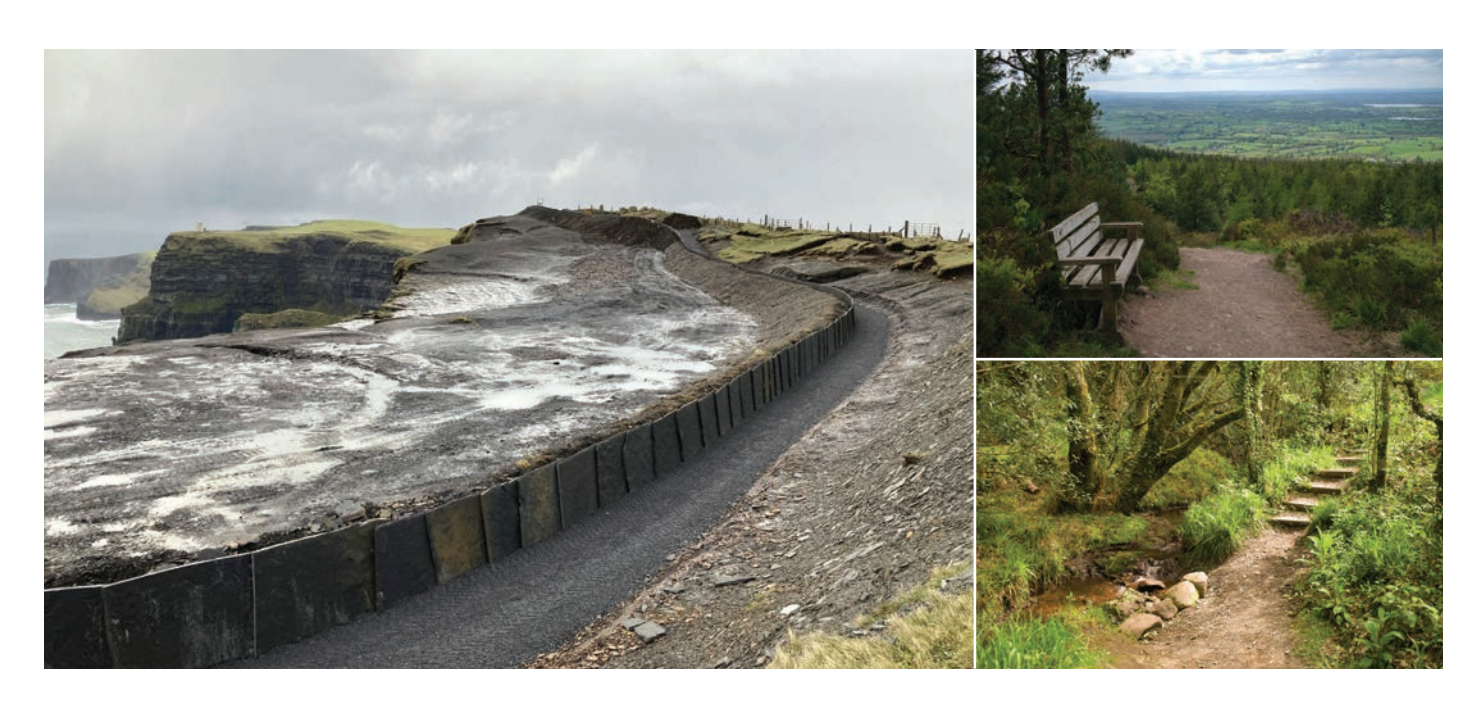
Funding of just over €88,000 has been awarded under Measure 1 of the Outdoor Recreation Infrastructure Scheme (ORIS) 2020 for projects in County Clare.

Funding of just over €88,000 has been awarded under Measure 1 of the Outdoor Recreation Infrastructure Scheme (ORIS) 2020 for five projects in County Clare. These projects are among 173 projects in the country to benefit from €3.2 million in funding announced by the Minister on January 18th under the ORIS scheme.