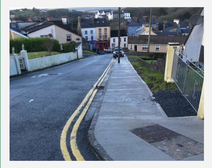
Church Hill, Ennistymon footpath completed and part funded by 2020 GMA allocation. Completed end of December prior to Level 5 restrictions.