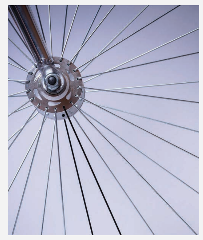
Shannon MD has welcomed €14,400 in ORIS funding for bicycle racks, benches, and information/interpretation boards in the Shannon Loop Yellow Route Estuary Walkway.

Shannon Municipal District has welcomed the announcement by Minister Heather Humphreys TD of funding under call 1 of the ORIS for €14,400 for bicycle racks, benches, and information/interpretation boards in the Shannon Loop Yellow Route Estuary Walkway. These works are to commence in the coming months.