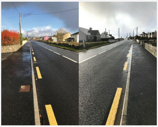
N67 Miltown pavement overlay and resurfacing of footpath, completed end of December 2020.