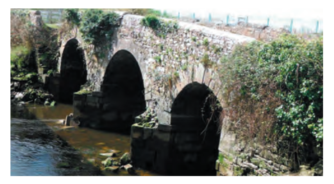
Latoon Bridge works - before repair.