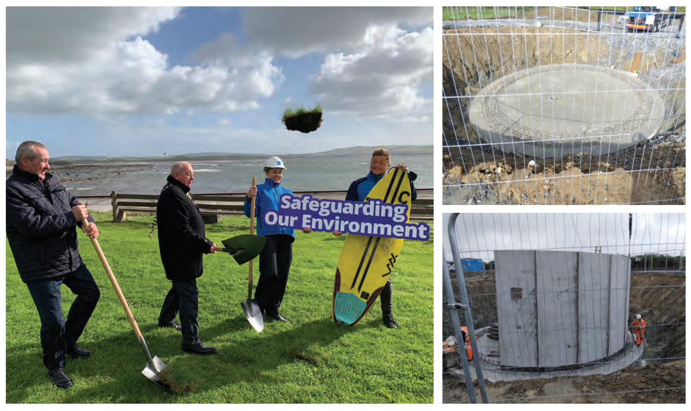
The sod was turned on the new Liscannor Wastewater Treatment Plant recently. When complete, this scheme will end the discharge of raw sewage to the sea near the pier in Liscannor.