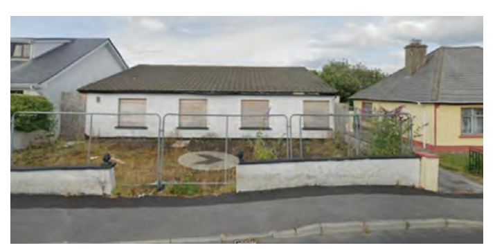
Derelict site at Ardlea Road, Ennis.

This month's photograph shows a house on Ardlea Road in Ennis, which has been completely refurbished. This shows again what can be done with existing vacant properties. It is now removed from our list of Derelict Sites.