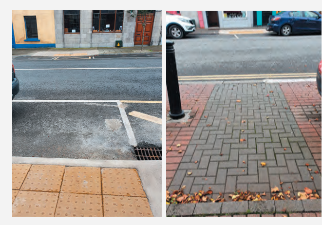
Kilrush Moore Street -Pedestrian Crossing - Dropped Kerbs & Tactile Paving

Works are currently underway to improve accessibility for all footpath users (improve "walkability"). Recommendations of the report (additional dropped kerbs, additional public benches, additional age friendly parking spaces etc.) are currently underway. As part of the programme of works, the Council has consulted with a number of mobility-impaired residents and with the manager of the Brothers of Charity Home in Kilrush. This will ensure that the works benefit as many residents and visitors as possible and are both mobility friendly and age friendly.