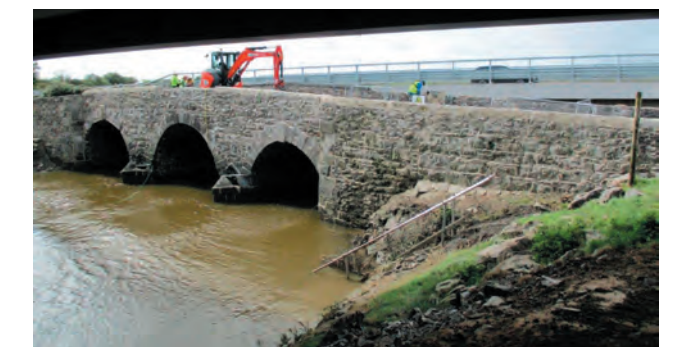
Latoon Bridge works - during repair.