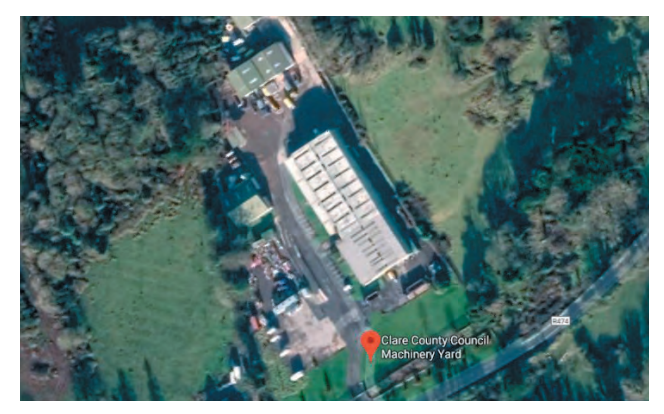
Beachpark Machinery Yard Buildings

A condition survey was carried out on the existing buildings located on the Machinery Yard site. A cost estimate for requisite repair works was subsequently prepared based on the findings and requirements necessary.