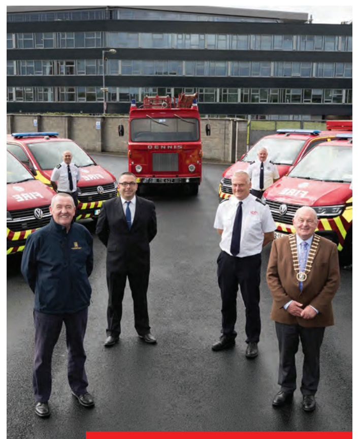
PHYSICAL DEVELOPMENT p32