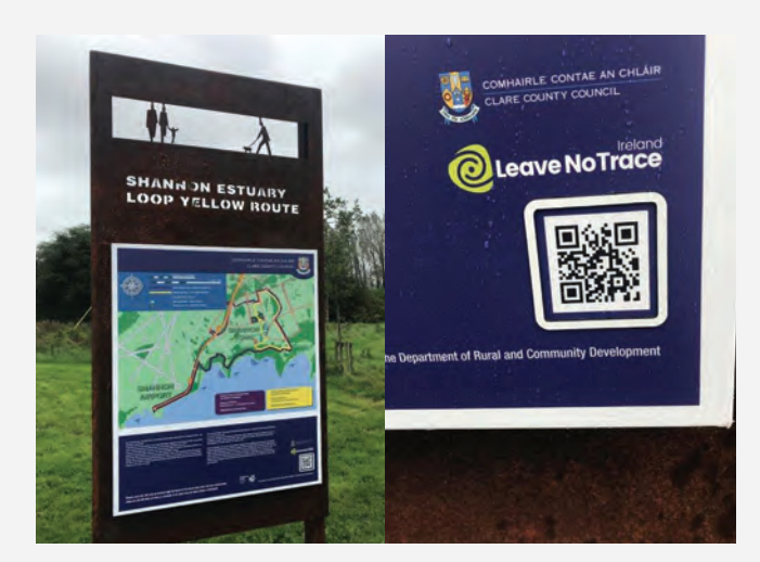
Shannon Information Board and QR code.

The new footpath from Shannon Hibernians to the Embankment Walk (Yellow Loop at Cluain Airne) has been substantially completed.