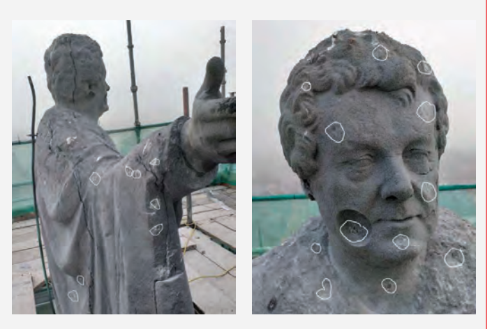
It is difficult to see where the drilling and stitching has taken place, as the filler is the same finish as the stone.

Conservation works are ongoing on the Daniel O'Connell monument with scaffolding expected to remain in place until the middle of October. Following closer examination of the cloak area and the head of the figure, it was established that it will require considerably more pinning and stitching than originally planned.