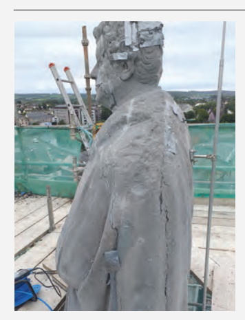
The vertical cracking is very evident after cleaning (left). The new lightning protection is visible in this image also. One of the longer pins is visible in this image.

The sealing of the cracks has just commenced (above left). The holes in the face are being left as found.