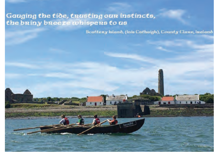
Daoine agus Áit: Connecting Our Communities postcard from Scattery Heritage Group.