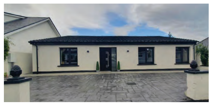
House on Ardlea Road Ennis, reburbished 2021