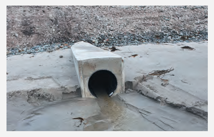
Replacement of drainage pipework at Seafield beach has been completed.