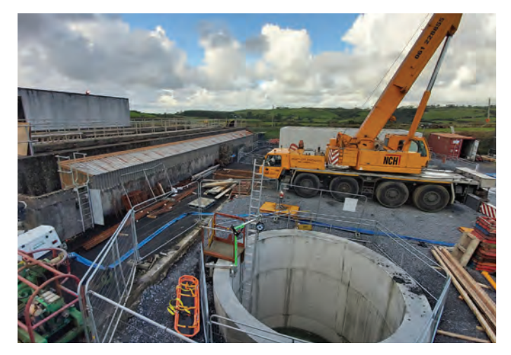
New Doolough RAL Upgrade.

A number of outages occurred in the East Clare Area in Killaloe, Tulla, O'Briensbridge, Meelick, Shannon, Craggaunowen, Cratloe, Kilkishen and Castlequarter. Area Operations crews are undertaking reservoir bypass mains and valve replacement works, to facilitate future cleaning and maintenance works, whilst maintaining continuity of supply to consumers.