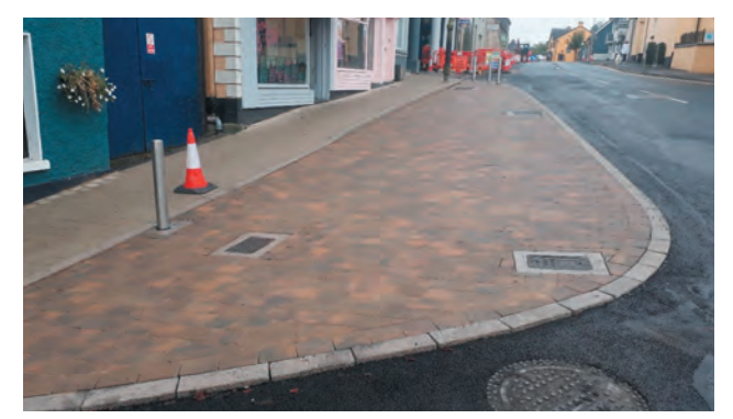
Sixmilebridge TVR Scheme

Sixmilebridge - Coir Infrastructure Appointed as main contractor. Construction works started in August 2021 and are progressing in accordance with the approved programme of works.