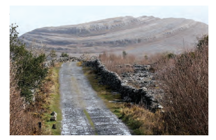
View of Mullaghmore by Áine Carey from Brothers of Charity Online Photography.

Two online exhibitions took place with Brothers of Charity and Inis Artists.