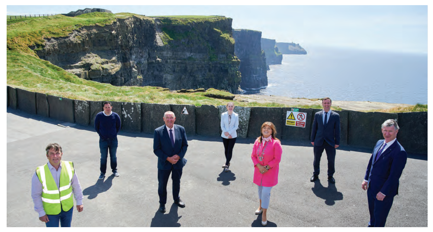
Picture taken at the contract signing for works on the Cliffs of Moher coastal walk.