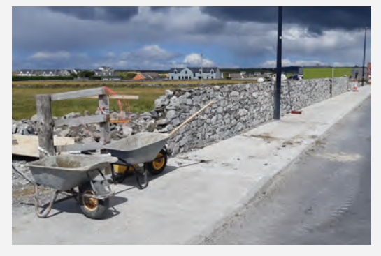
Works are due to be completed on the final phase of footpaths from Fitz Cross to Fisher Street, Doolin.