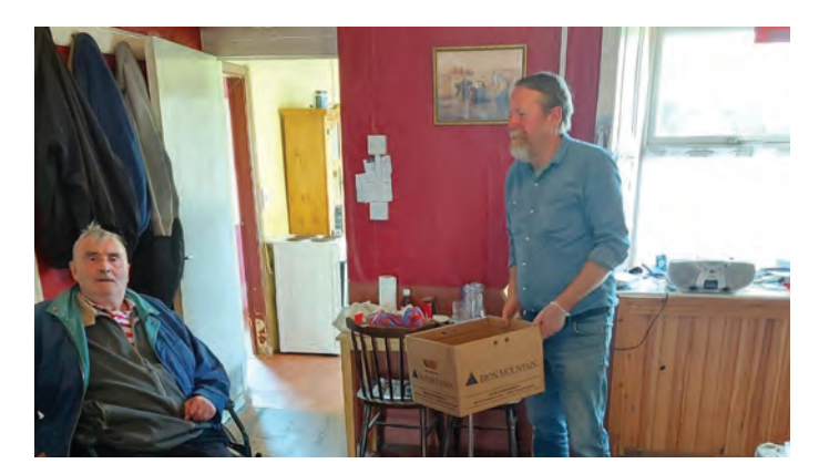
In total, 526 deliveries have been carried out since the service started.