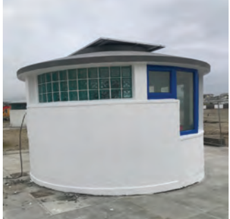
Kilkee beach hut refurbishments.