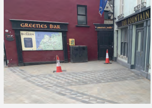
Enhancement and upgrading of Ballyvaughan paving.