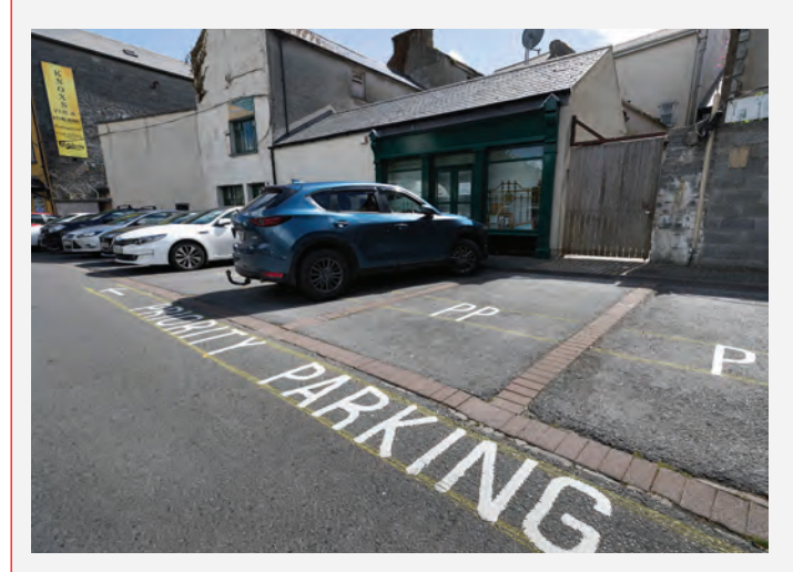
Priority parking spaces enable vulnerable members of the public to park in close proximity to Ennis Town Centre.