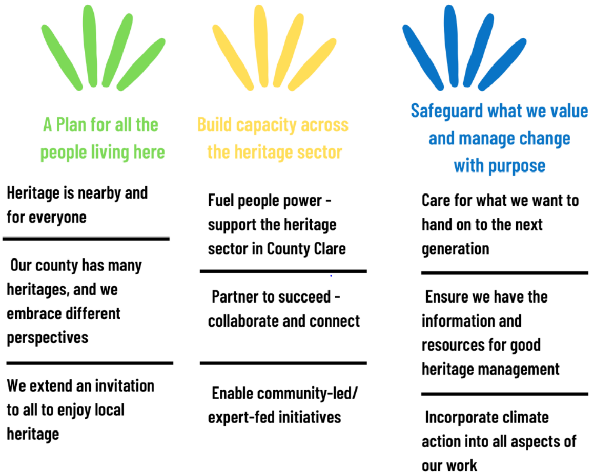
Figure 2 Overall Vision for the Plan