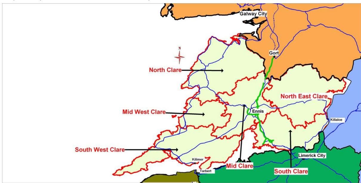
Map 1 Simplified Rural Economic Development Zones in Clare

The Commission for the Economic Development of Rural Areas (CEDRA) identified a number of areas in the county that displayed different levels of self-sufficiency in terms of offering employment opportunities for their resident workforce and offering their enterprises a resident workforce. These areas were entitled Rural Economic Development Zones (REDZs). Six such areas (North, Mid-West, South-West, North-East, Mid and South Clare) were identified in Clare with some areas overlapped county boundaries. Map 1 presents a simplified version of those six areas by a small expansion of some and a small contraction of others to ensure all fitted within the county.