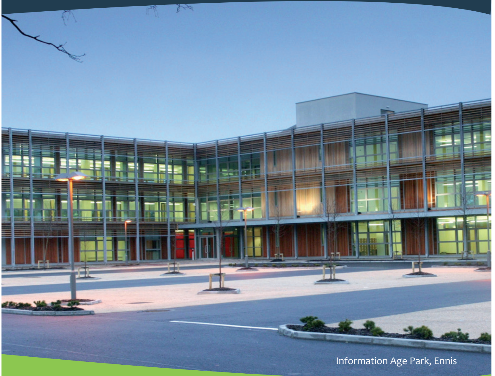
Information Age Park, Ennis

Clare offers direct access to global markets, a highly talented labour force, a competitive cost base and a wide range of support services.