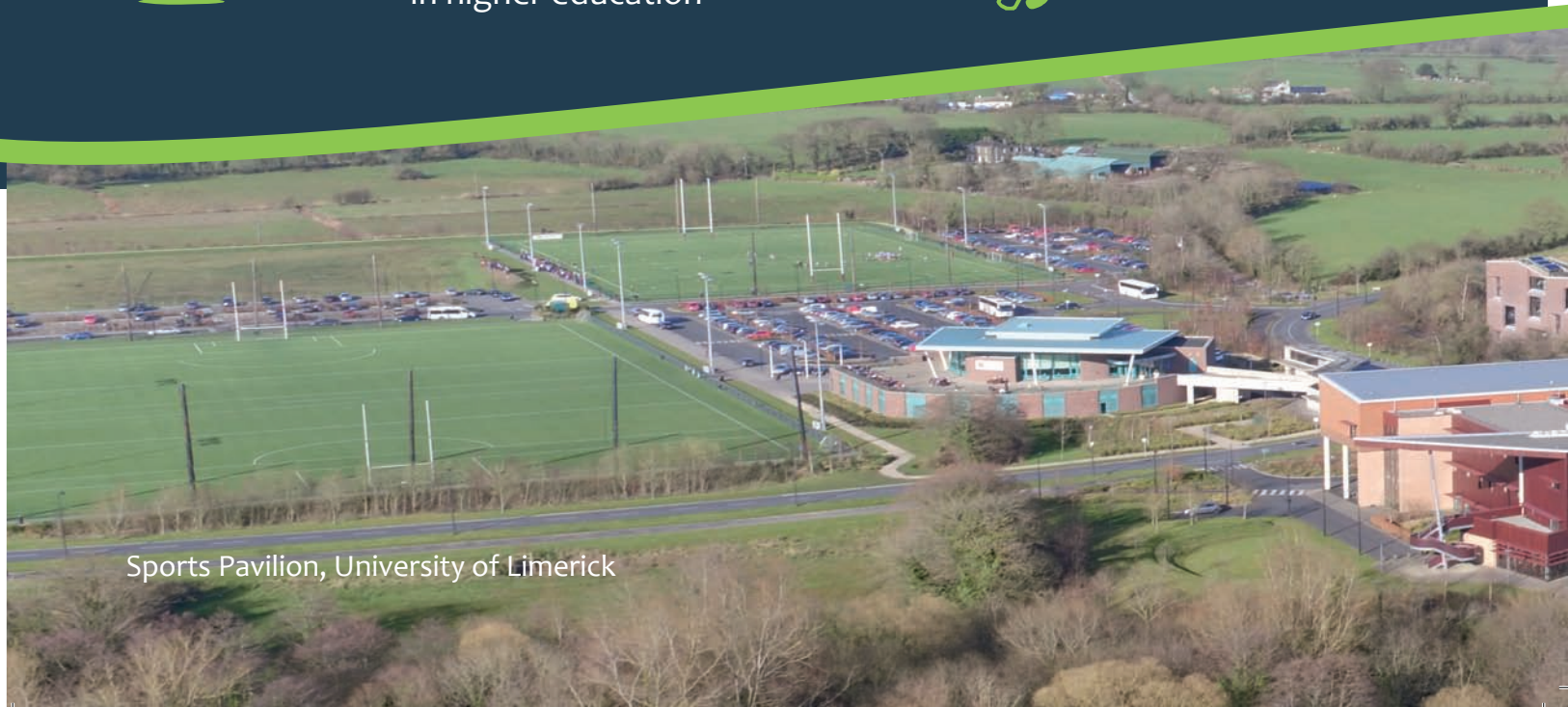
Sports Pavilion, University of Limerick