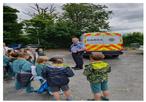
Community Engagement Day, Ennis,